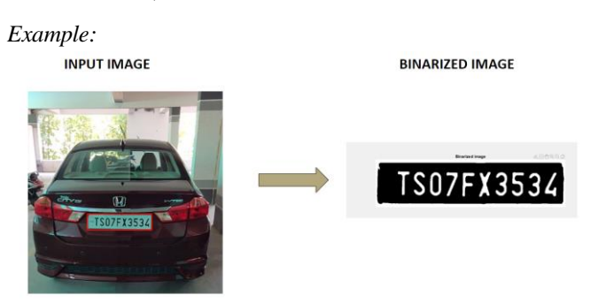
Fig.3. The transition of an input image to a Bitonal Image

Pixels with a bit value of zero are transformed to black, and pixels with a bit value greater than zero are turned to white (a bit value of one).