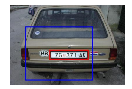
Fig.2. Working of R-CNN

R-CNN, or Region-Based Convolutional Neural Network, is a form of machine learning model used for computer vision applications, particularly object detection. A two-stage detection technique is used. The first stage finds a selection of image regions that could contain an object. The object in each region is classified in the second stage. The R-CNN model uses a process called selective search to extract information about the region of interest from an input image. The rectangular boundaries can be used to illustrate the region of interest.