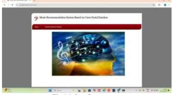
Fig 4.1: Interface

This is the initial user interface of the system which consists of home and Emotion Detection Webcam. We can access webcam by clicking on it, next it opens the webcam. Where we can give our image.