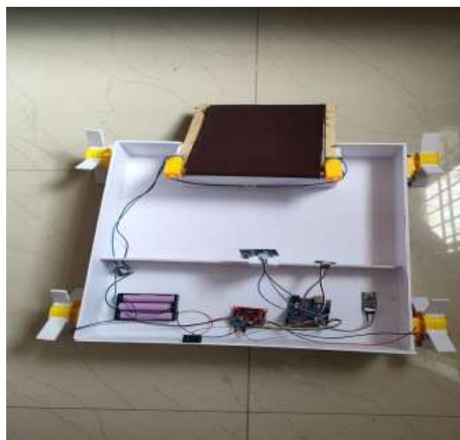
Figure 1: Final Prototype Assembly and Component Integration

Traditional methods of cleaning lakes are heavily dependent on manual involvement, which is time-consuming, inefficient, and dangerous to workers. Contact with polluted water exposure can cause severe health risks. Automatic robotic alternatives are quite effective in reducing human involvement and may facilitate continuous cleaning operations. Aquabot is a