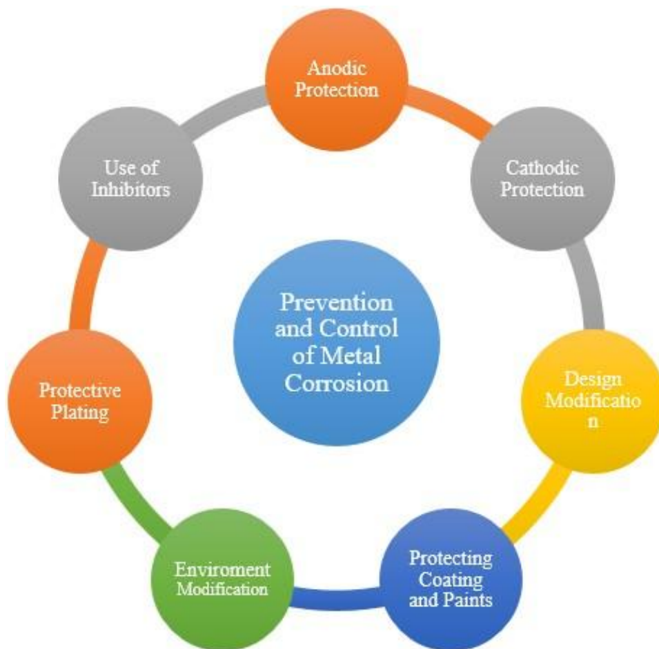
Figure 1: Commonly used methods for prevention and control of metal corrosion.

There were various methods to prevent corrosion show in figure 1, which decreased the rate of corrosion and increase the lifetime of metals and its alloy. Inhibitors were commonly used to prevent or reduce metal corrosion by forming a protective layer on the metal surface. These were used in lower concentration in corrosive media and successfully reduces the deterioration of a metal exposed to the corrosive environment [9, 10] .