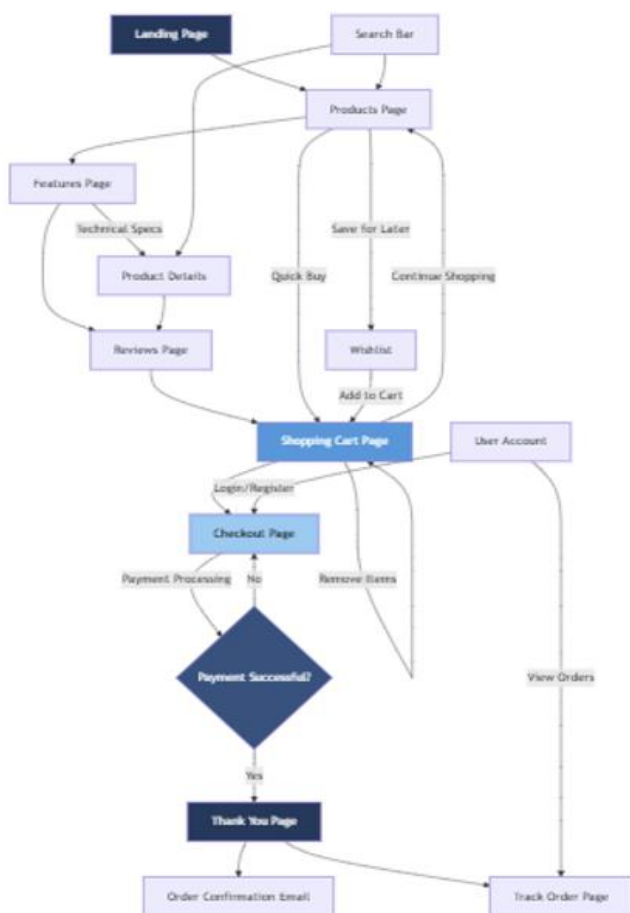
Fig. Flow chart