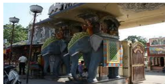
STATUES ELEPHANTS ON ENTRANCE