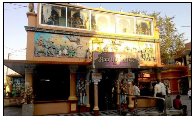
Annpurna temple before reconstruction

Shree annpurna temple is located at indore Madhya Pradesh . this temple is dedicated to goddess annpurna devi the deity of food . In this temple we can see the idol of Maa Annapurna glowing with Maa Kali and Maa Saraswati. Temple also houses the shrines of lord shiva , lord hunman and kalbhairav . This temple is situated in the main city of temple at 5 km away from Indore Railway station.