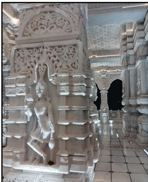
DWARPAL ON ENTRANCE