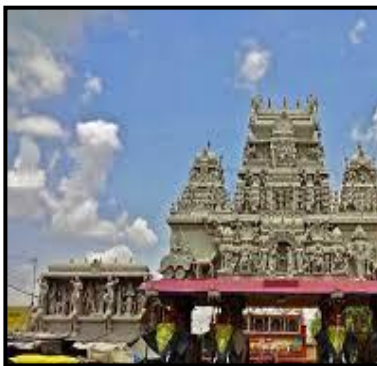
GOPURAM OF ANNPURNA TEMPLE INDORE.