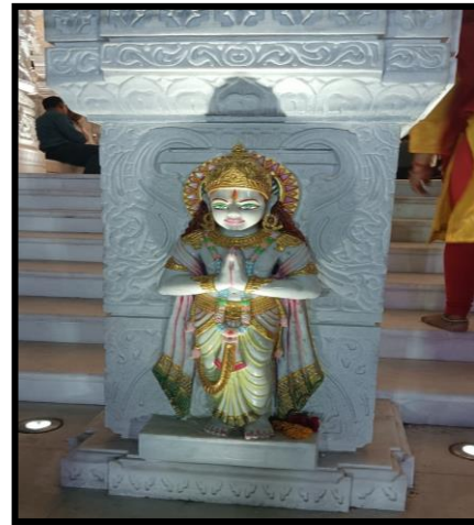
Sculptures carved on pillars