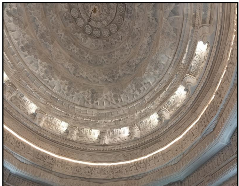
64 yoginias and detailing on ceiling of mandapa

Reconstruction of annpurna temple aims for the beautification, cleanliness, and expansion of the religious site and the city of Indore.