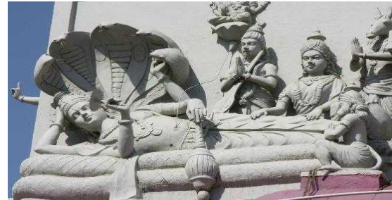
EMBELLISHMENT ON GOPURAM OF TEMPLE

accommodate 1000+ people to sit inside. In this hall Pravachan's are given frequently on morality and religious life by various thinkers and Spiritual Guru's.