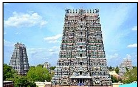
MEENAKSHI TEMPLE MADHURAI

The temple is 108 feet long, 54 feet wide with 51 pillars and the shikhara will be 81 feet high. The idols of Navadurga, 10 Mahavidyas and 64 Yoginis are being carved in the Sabha Mandap. Along with this, idols of other deities are also