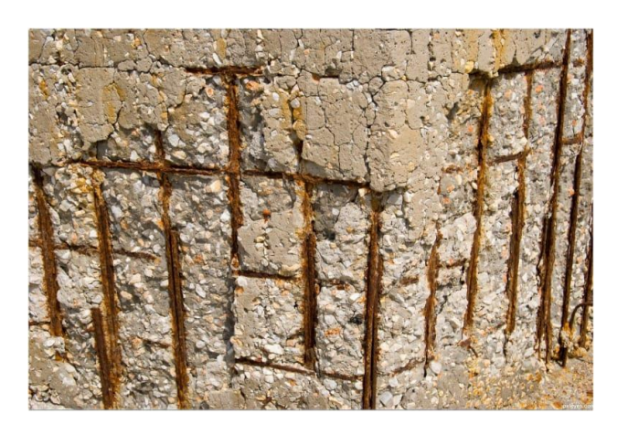
A. Impact of Corrosion in Coastal Areas

Some of the reasons inducing corrosion in coastal areas are discussed below: