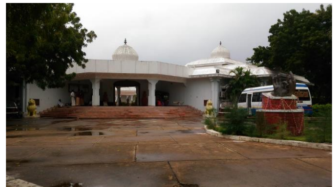
Fig.2 .Image of South zone cultural center exterior

The south zone cultural centre is located in 25 acres of land gifted by the government of Tamilnadu Adjacent to the Tamil university in Thanjavur with the financial assistance of Rs.2 crores from the government of Tamil nadu.