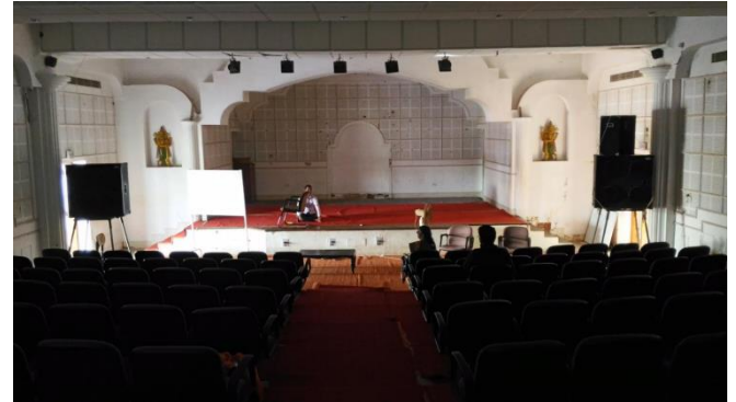
Fig.6. Image of Auditorium

The Air conditioned Auditorium measures 2500 sq.ft can seat upto 133 people. The stage has wooden floor with green rooms on either side.