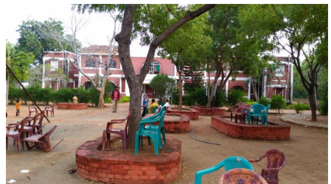
Fig.8. Image of Terracotta garden

Statues of animals , birds , dancers , village goods etc adorn the terracotta garden. The retention of the finer features despite the size of the sculpture is indicative of the prowess of the traditional craftsmen.