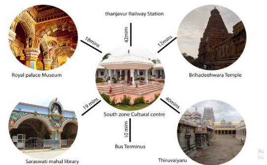
Fig.1. Surrounding Landmarks

The south zone cultural centre is located in 25 acres of land gifted by the government of Tamilnadu Adjacent to the Tamil university in Thanjavur with the financial assistance of Rs.2 crores from the government of Tamil nadu.