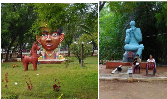
Fig.5. Image of Sculpture Garden

The sculpture garden Total area of 5 acres of land has sculptures in various media created by eminent sculptors. 5 life size sculptures in copper , white cement and ceramic created by eminent sculptors adorn the garden. Copper Garden The Copper Garden at the Entrance was created by Sirpi Kanniappan.