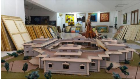
Fig.3. Image of Art gallery