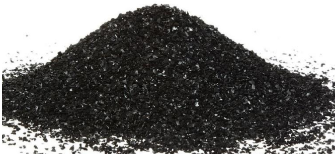
Fig 2. Activated Carbon

These micropores provide superb conditions for adsorption to occur, since adsorbing material can interact with many surfaces simultaneously. Tests of adsorption behavior are usually done with nitrogen gas at 77 K under high vacuum, but in everyday terms activated carbon is perfectly capable of producing the equivalent, by adsorption from its environment, liquid water from steam at 100 °C (212 °F) and a pressure of 1/10,000 of an atmosphere.