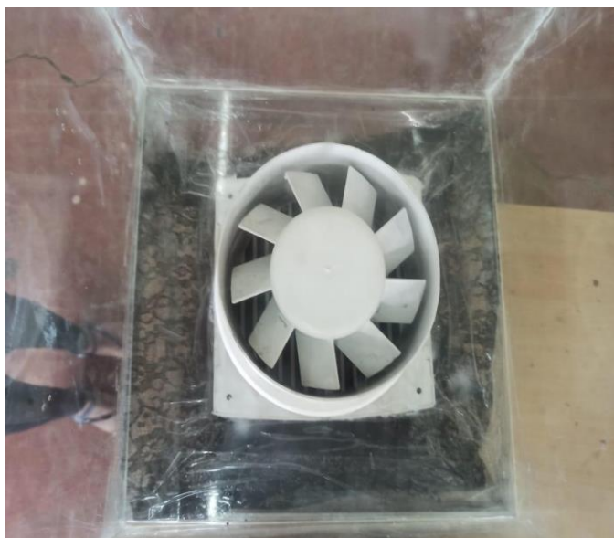
Fig -5 Working model

5. It is economic, cost effective and eco-friendly.