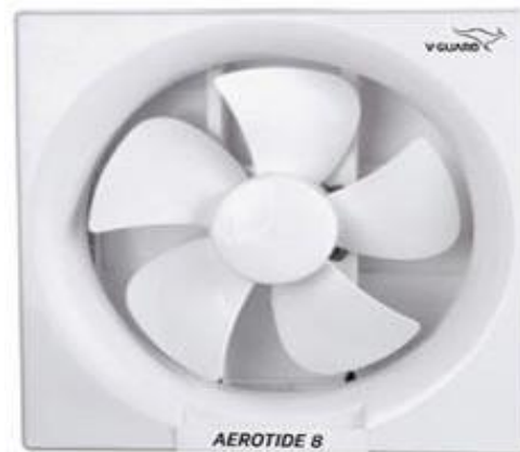
Fig -3 Exhaust fan