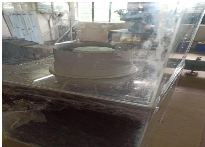
Fig -4 Working model

build up. Stagnant air is vented out of the home, allowing conditioned air to fill the space.