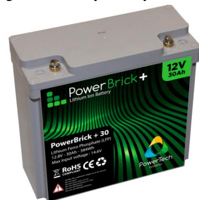
Fig -2: Lithium Battery

The storage battery or secondary battery is such a battery where electrical energy can be stored as chemical energy and this chemical energy is then converted to electrical energy as and when required. The conversion of electrical energy into chemical energy by applying external electrical source is known as charging of battery. Whereas conversion of chemical energy into electrical energy for supplying the external load is known as discharging of secondary battery.