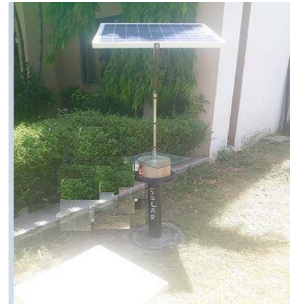
Fig -4: renewable energy based community mobile charging station

public use in public places. A universal charging port is connected to the system which has 8 ports to charge 8 mobile phone at same time.