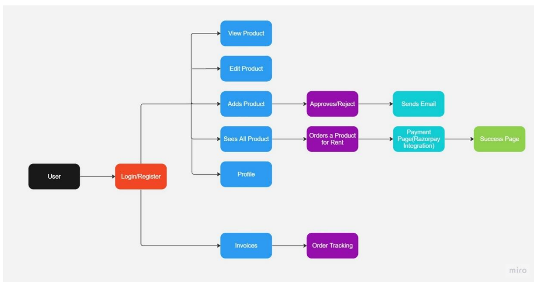
Fig-2: Customer Module