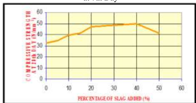
Fig. 2- Compressive Response of Concrete with Copper Slag at 28th Day