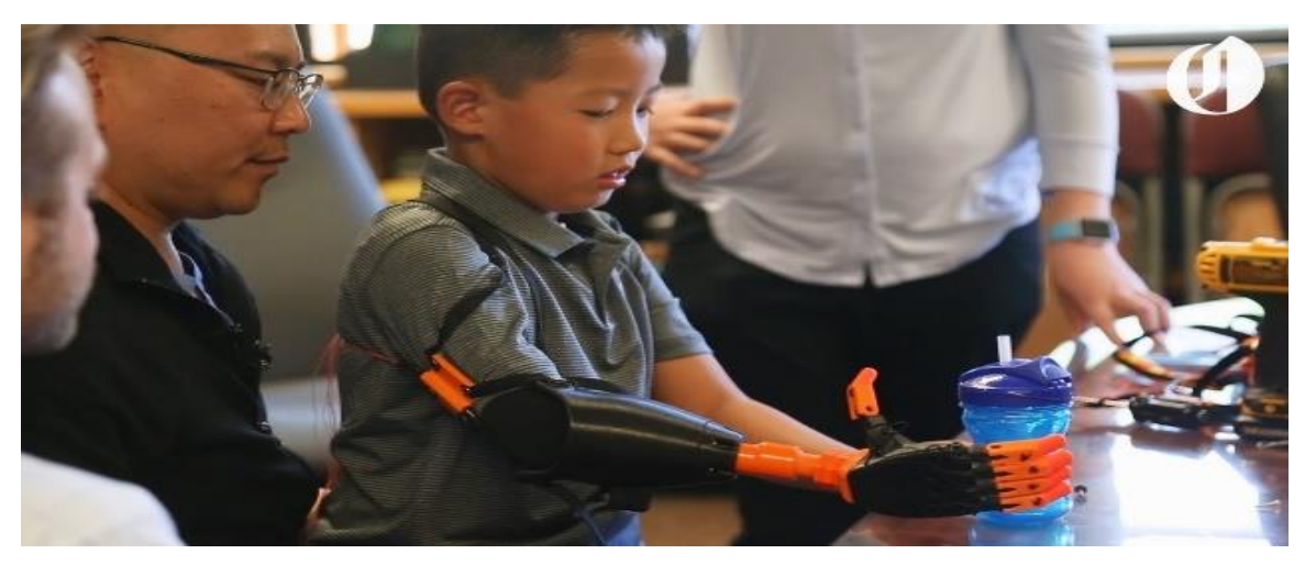
Figure 2 Implementation model