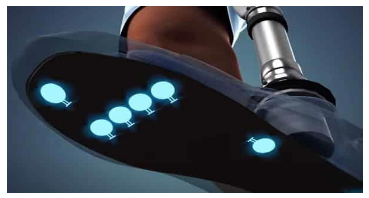
Fig. 2 Sensory Feedback for Bionic Feet