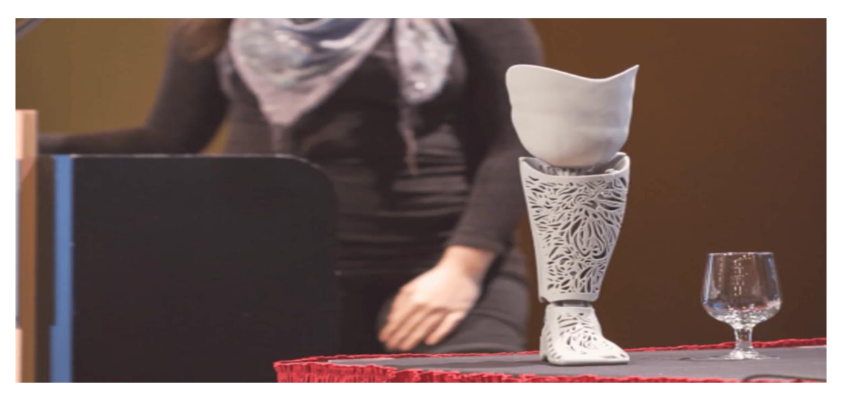
Figure 3 Printed prosthetic Leg