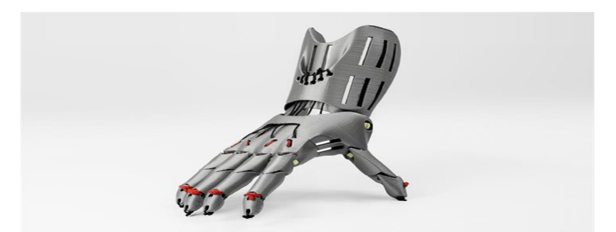
Figure 1. 3D Printed prosthetic Palm