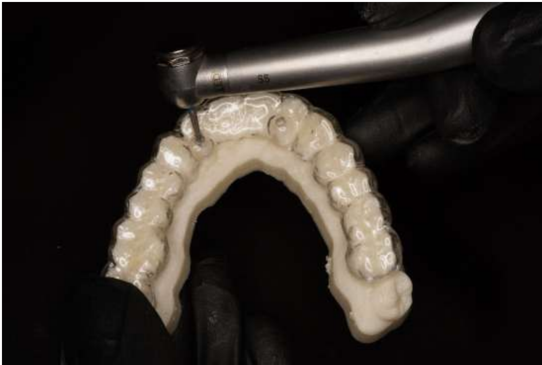
Figure 8: Access hole made using the custom digital abutment screw location guide

Figure 7: Use the custom clear retainer to highlight the screw access holes and drill through it for easy retrieval of prosthetic screw.