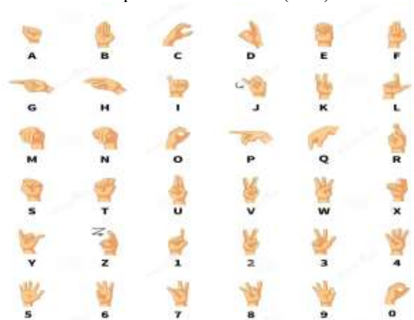
Fig1. sign languages used in the algorithm