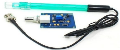
Fig-3 pH Sensor

The pH of a solution is the measure of the acidity or alkalinity of that solution. The pH scale is a logarithmic scale whose range is from 0-14 with a neutral point being 7. Values above 7 indicate a basic or alkaline solution and values below 7 would indicate an acidic solution. It operates on 5V power supply and it is easy to interface with Arduino or raspberry-pi. The normal range of pH is 6 to 8.5. The Fig-3 shows pH sensor to be interfaced to board.