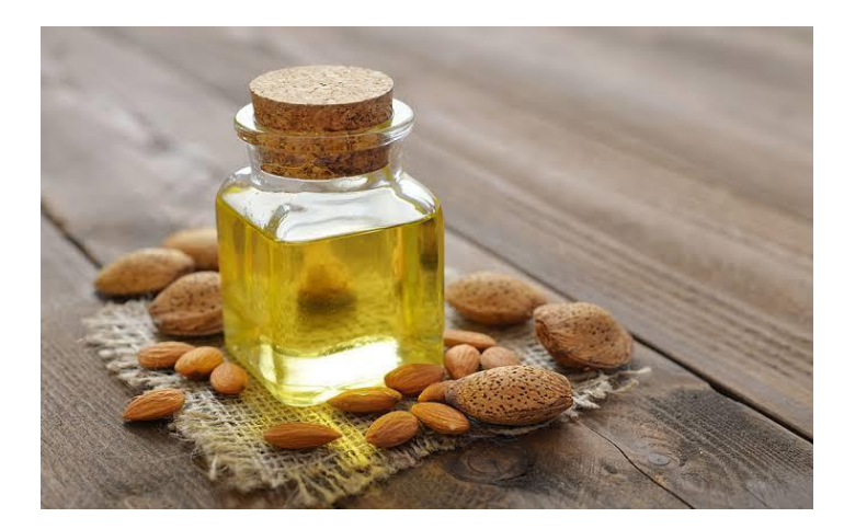
Fig. no.3 Almond Oil

According to the FDA, almond or bark almond oil has a variety of uses and can be used in a variety of cosmetic formulations to enhance the effectiveness of each product. [2] It is an oil made from glycerine and oleic acid and has a mild odour and slightly nutty taste. The production of almond oil is an important business worldwide. Almond oil is produced through a separation process of extraction and pressing. [4]