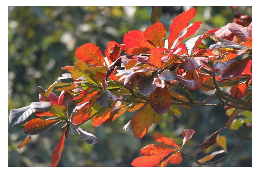
Fig. no.2:- Almond Plant

It is worth noting that it is not the same as almond oil or sweet almond oil, which you may have heard. Sweet almond oil comes from a special seed and has a slightly different texture. First, while sweet almond oil is a solid and insoluble oil, bitter almond oil is a highly volatile and volatile essential oil. Historically, people have used the latter to treat sore throats, aches, pains and coughs, but it is necessary to be careful and use it after careful consultation because it can be poisonous.