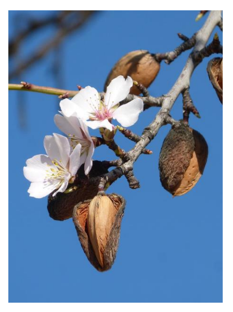
Fig. no.1:- Almond Fruit