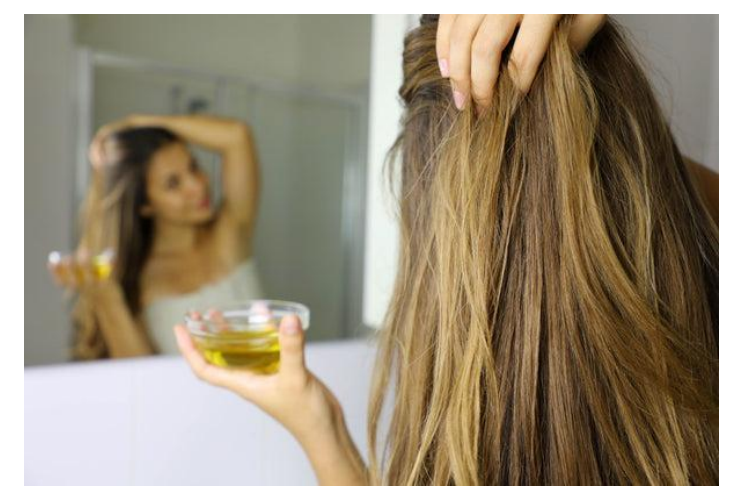
Fig. no. 5:- Uses of Almond Oil for Hair