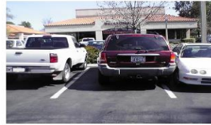
Figure 1: Automatic allotment Parking Figure 2: Manual Parking