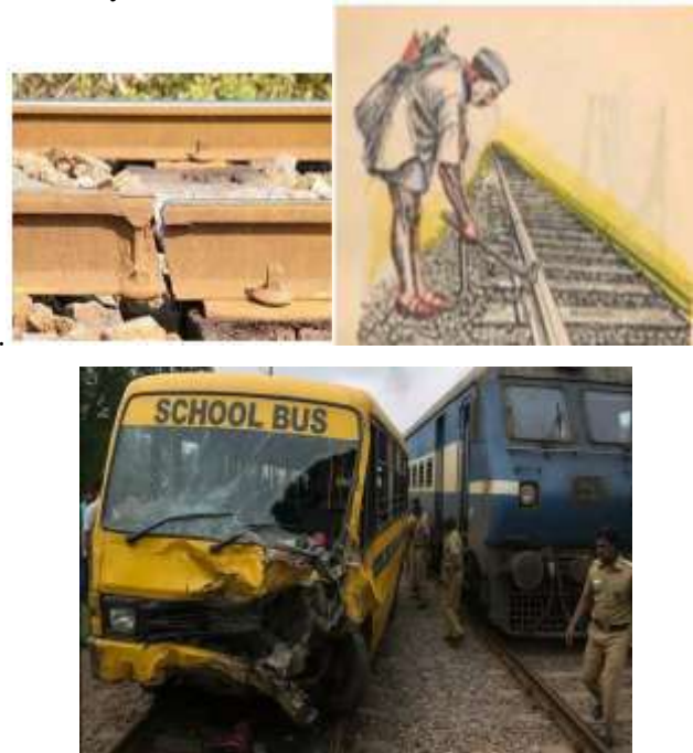
Figure 1. Crack on track, Manual crack detection by human and railway accidents

Despite significant advancements, several challenges persist in the implementation of automated railway crack detection systems. High deployment costs, integration complexity, power management issues, and limited scalability hinder large-scale adoption. Furthermore, many existing systems lack precise fault localization and rapid alert mechanisms required for immediate corrective action. There is a need for cost-effective, scalable, and energy-efficient IoT based systems with real time remote reporting and accurate crack detection. The goal of this paper is to critically examine the latest contributions to the research on the system of crack detection in railway tracks and the development of IoT-based, sensor-based, embedded systems, and wireless communication models. This study will make it possible to create advanced, reliable and intelligent railway monitoring systems that will improve the safety and efficiency of passengers and operations by establishing the current trends, limitations and research gaps.