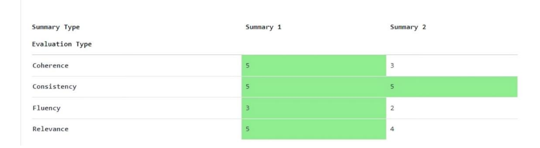
Figure 3 (iii): Evaluation Summary of the Model

- Streamlined Access to Patient Records: Through decentralized data storage mechanisms, we have ensured streamlined access to patient records while maintaining data security and privacy. Healthcare professionals can now access complete medical histories efficiently, enabling more comprehensive and timely care delivery.