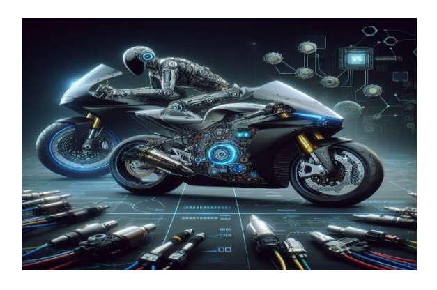
Fig.2. Futuristic sports bike

The incorporation of autonomous decision-making into the riding experience not only enhances user interaction but also introduces a new realm of ethical dilemmas that require thoughtful analysis and