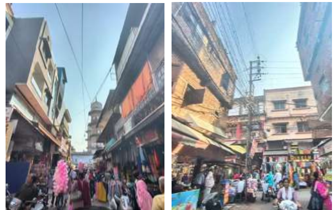
Fig -2: Images showing Traffic Congestion in the Market.

Encroachments, poor sanitation, traffic congestion, and unregulated signage threaten the market's physical integrity. Additionally, the lack of heritage-sensitive planning and maintenance has caused older structures to deteriorate.