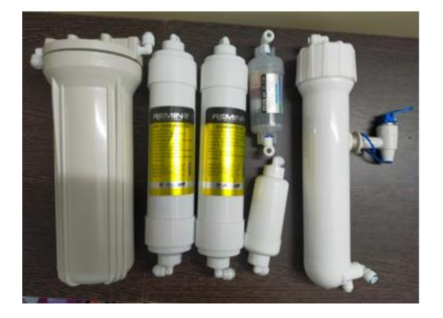
Fig 1: filter used in this work.

Once the salt content is removed from the water, some mechanical filters are used to purify the water. In that, carbon filter, sediment filter and reverse osmosis and UV filters are used.