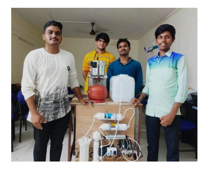
Fig 4: Sea water purifier.

Rupees. With this cost, the sea water is desalinated and purified to convert in to drinkable water. Once the water is converted, its TDS level of 80 is observed.