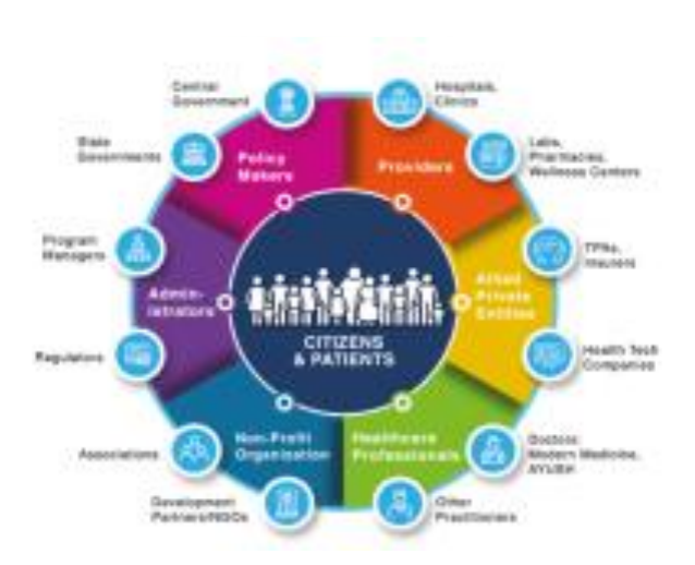
Fig 2 : ABDM Ecosystem