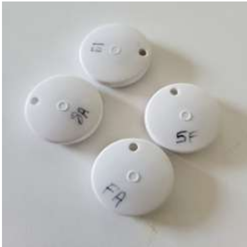
Fig -2: i Beacons