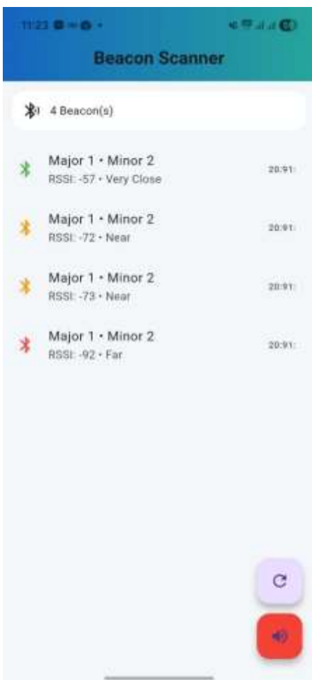
Fig -3: Mobile Application