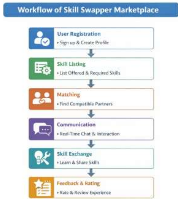
Fig. 1. Workflow Diagram

data processing, and real-time communication to provide a seamless experience.