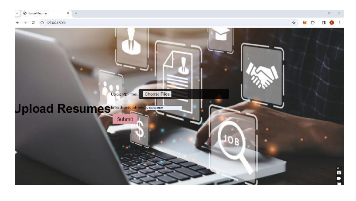
Fig 4: Selecting specified role