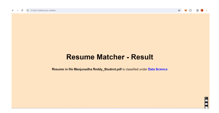
Fig 5 Final Predicted result