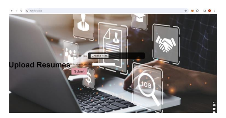
Fig 2: HOME PAGE