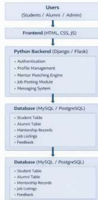
Smart Alumni Connect Architecture Using Python

This architecture allows the platform to be easily expanded in the future with additional features such as AI-based career prediction or mobile application integration.