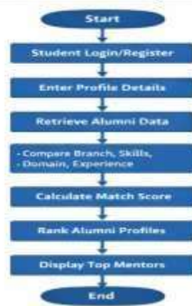
Figure 5: Mentor Matching Flowchart