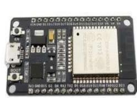
Fig: ESP-32 Module

ESP32 is a series of low-cost, low-power system on a chip microcontrollers with integrated Wi-Fi and dual-mode Bluetooth. ESP32 is highly-integrated with in-built antenna switches, power amplifier, low-noise receive amplifier, filters, and power management modules. ESP32 adds priceless functionality and versatility to your applications with minimal Printed Circuit Board (PCB) requirements. ESP32 can perform as a complete standalone system or as a slave device to a host MCU, reducing communication stack overhead on the main application processor. ESP32 can interface with other systems to provide Wi-Fi and Bluetooth functionality through its SPI / SDIO.