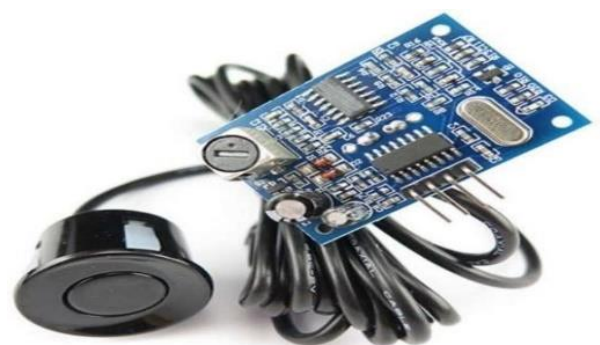
Fig: JSN-SR04T Ultrasonic Sensor

The module is triggered after the distance measurement, if you cannot receive the echo (the reason exceeds the measured range or the probe is not on the measured object), ECHO port will automatically become low after 60 ms, marking the end of the measurement, whether successful or not. LED indicator, LED non-power indicator, it will receive the signal after the module will be lit, then the module is working.