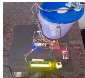
Fig 8: Final result part

The Node MCU microcontroller is used as a cloud wifi module. This is accomplished using an ultrasonic sensor and male and servomotor. LCD is used to display the level of the garbage. A buzzer sound is used to notify and alert the admin through the buzzer and it sends a notification message to the admin through the cloud. Everyone can view the cloud page at any time.