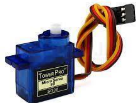
Fig 5: Servomotor

The dustbin lid can be opened with the aid of a servo motor. This servomotor, which is a rotary actuator or linear actuator that enables precise control of angular or linear position, velocity, and acceleration, is used to open the lid after the waste is detected by an ultrasonic sensor in accordance with the Arduino's programming. A servomotor is a closed-loop servomechanism that regulates its motion and ultimate position using position feedback.