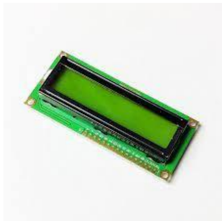
Fig 6: LCD display

LCD is also known as a Liquid Crystal Display. Depending on how far away the trash is from the ultrasonic sensor, the LCD display will reveal the status of the waste. The distance has been set in the Arduino coding. These figures show the reading of the garbage from the ultrasonic sensor and the displaying at the LCD display