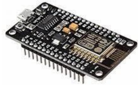
Fig 3: NodeMCU

The controller we used in this project is NodeMCU. NodeMCU is a microcontroller with a wifi module. It uses an ESP8266 microcontroller chip. It calculates the object's distance and sends it to the MCU ESP8266. By calculating the object's distance, MCU ESP8266 instructs the servo motor to rotate and open/close the lid.