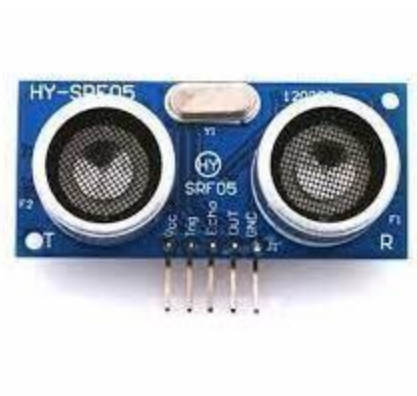
Fig 7: Ultrasonic sensor

An ultrasonic sensor is used to measure the distance of the target (garbage). It is used to detect the object or foot tap of a human so that it opens the lid of the dustbin. And it is used to measure the level of the dustbin so that we can know the status through lcd.