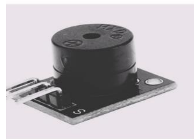
Fig 4: Buzzer

A buzzer, often called a sounder, an audio alarm, or an audio indication, is a simple audio device that produces sound in response to an incoming electrical input. Here, We used the buzzer that beeps to indicate that the level of garbage crosses above 90%.