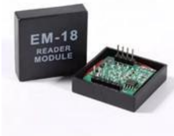
Fig 4: EM18 RFID reader

module utilises Radio Frequency Identification (RFID) technology to read and identify passive RFID tags. These tags typically contain a unique identification number or data that can be transmitted wirelessly to the RFID reader.