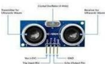
Fig 5 :Ultrasonic Sensor

The EM18 RFID reader is a compact and versatile module operating at 125 kHz, designed for reading RFID tags compliant with the EM4100 protocol. With its simple serial communication interface, low power consumption, and compatibility with various applications such as access control, attendance systems, and inventory management, the EM18 RFID reader offers an efficient and cost-effective solution for RFID-based identification needs