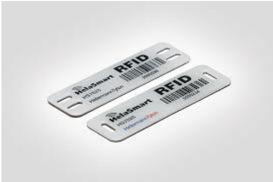
Figure 3: RFID tags