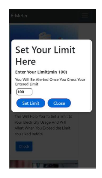
Fig -6: Setting Monthly Limit