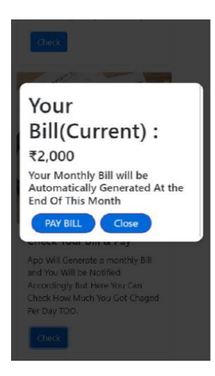
Fig -4: Bill Acknowledgement