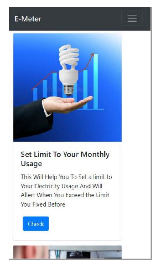
Fig -5: Limit Set