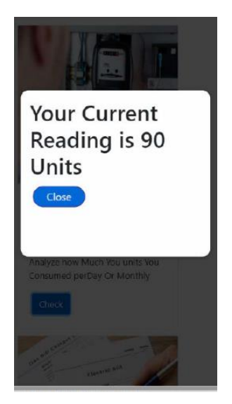
Fig -2: Reading Acknowledgement