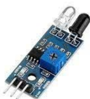
Fig 7.2 IR SENSOR(INFRARED)