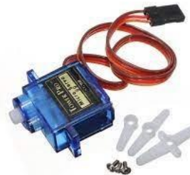
Fig 7.3 SERVO MOTOR

Moisture sensor in garbage management is used to separate wet and dry waste into its specific compartments , for example if a banana peel is thrown over dustbin this sensor would identify