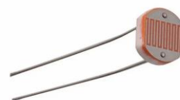
Fig 6.1 LDR SENSORS (Light Dependent Resistor)