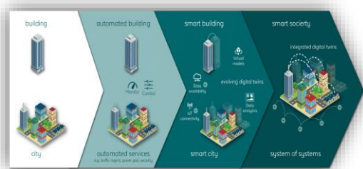
Fig 1.1 Smart society

The impact of digitization, on society, politics and economics has ranging implications for aspects of human life. It raises questions about the kind of society that will emerge as automation and algorithmic data processing become more prevalent. What will this digital society ultimately look like? How do theories and concepts help us understand the changes we are witnessing? Moreover how do network devices and technologies that have seamlessly become a part of our lives affect the structures of nations and our personal experiences? These thought provoking questions about the characteristics of societies pose a significant and complex challenge, for researchers. While empirical research provides insights it only offers understanding as it often focuses on specific aspects of these multifaceted phenomena.