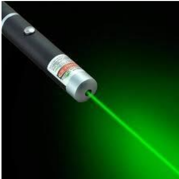
Fig 8.2 Laser

LDR sensor and Laser module are installed on the fences of society to check no one climbs over the fences