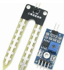
Fig 7.1 MOISTURE

4. Challenges and Opportunities: Explore the challenges faced in garbage management, such as waste contamination, limited landfill space, and the need for efficient waste separation. Discuss opportunities for innovation in waste management, including the use of AI and automation to enhance recycling and reduce landfill waste