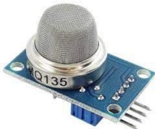
Fig 5.2 MQ135- AIR QUALITY SENSOR

2. Environmental Sensors for Air Quality, Climate, and Pollution: Smart Society initiatives often involve the use of advanced environmental sensors that monitor air quality, weather conditions, and pollution levels. These sensors can detect pollutants such as particulate matter, carbon monoxide, and volatile organic compounds. They also provide real-time data on climate conditions, which is crucial for addressing climate change, enhancing disaster preparedness, and ensuring the well-being of urban populations.