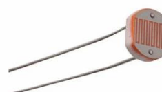
Fig 8.1 LDR SENSORS (Light Dependent Resistor)