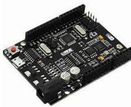
Fig 5.1 ARDUINO UNO WIFI ATMEGA328 + ESP8266

1.Sensor Technologies for Water Monitoring: In a Smart Society, sensor technologies play a pivotal role in monitoring the quality of water sources. This involves the deployment of sensors in bodies of water, reservoirs, and water treatment facilities to track parameters such as pH levels, turbidity, temperature, and the presence of contaminants. Aiding in early detection of pollution, ensuring safe drinking water, and protecting aquatic ecosystems.