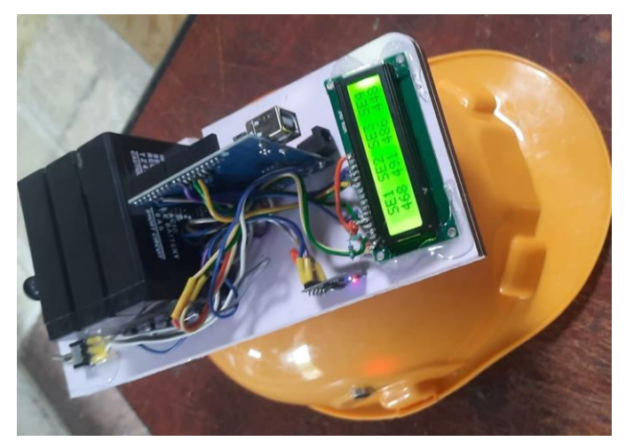
Fig.3. Designed Smart Helmet

Industrial Safety: Workers in industrial settings, such as factories or warehouses, can wear smart helmets for accident detection, especially when handling heavy machinery or working in potentially hazardous environments.