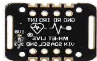
Fig-4: Heartrate sensor