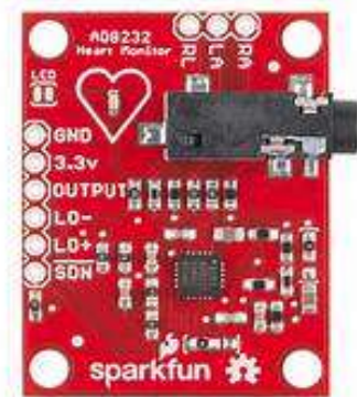
Fig-2: ECG sensor