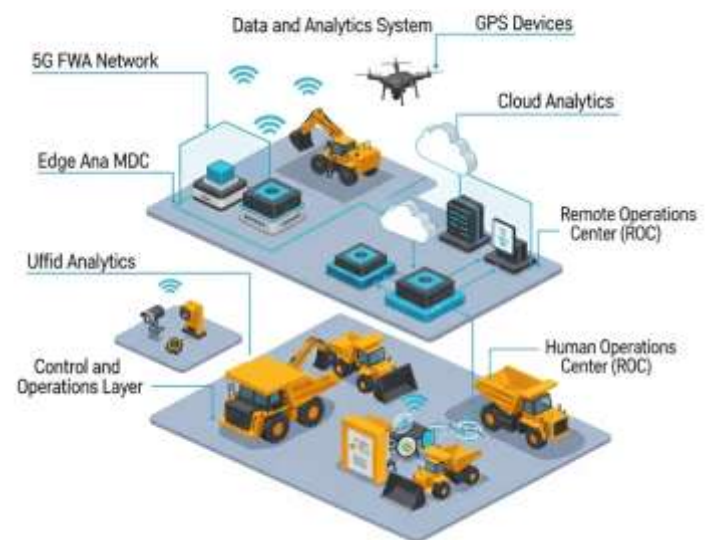
On-site Infrastructure Layer Smart Mining System build