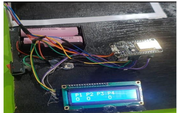
Figure-1. Displaying the parking Slots