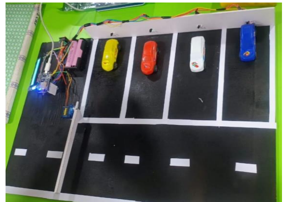
Figure-2. The parking was filled and the gates were closed.