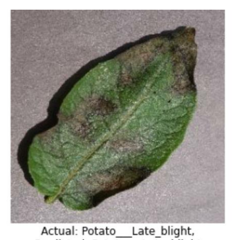
Predicted: Potato__Late_blight. Confidence: 100.0% Fig 1.3 Disease Classification

International Journal of Scientific Research in Engineering and Management (IJSREM)Volume: 08 Issue: 05 | May - 2024SJIF Rating: 8.448ISSN: 2582-3930