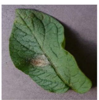
Actual: Potato__Early_blight, Predicted: Potato_Early_blight. Confidence: 99.87%