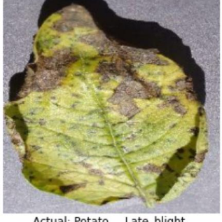
Actual: Potato__Late_blight, Predicted: Potato__Late_blight. Confidence: 99.92%