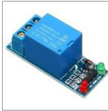
Figure 5 RELAY