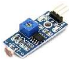
Figure 3 LDR (Light Dependent Resistor)