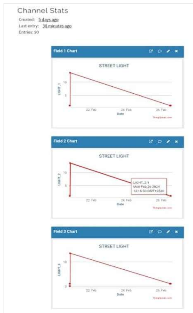
Figure 6 Field chart

The implementation of the proposed Smart Street Light Fault Detection System yielded promising results, showcasing its effectiveness in enhancing the efficiency, reliability, and sustainability of urban street lighting infrastructure. Through real-time monitoring of ambient light conditions using the Light Dependent Resistor (LDR) sensor and intelligent control mechanisms implemented on the NodeMCU microcontroller, the system demonstrated the ability to