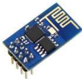
Figure 4 WIFI MODULE