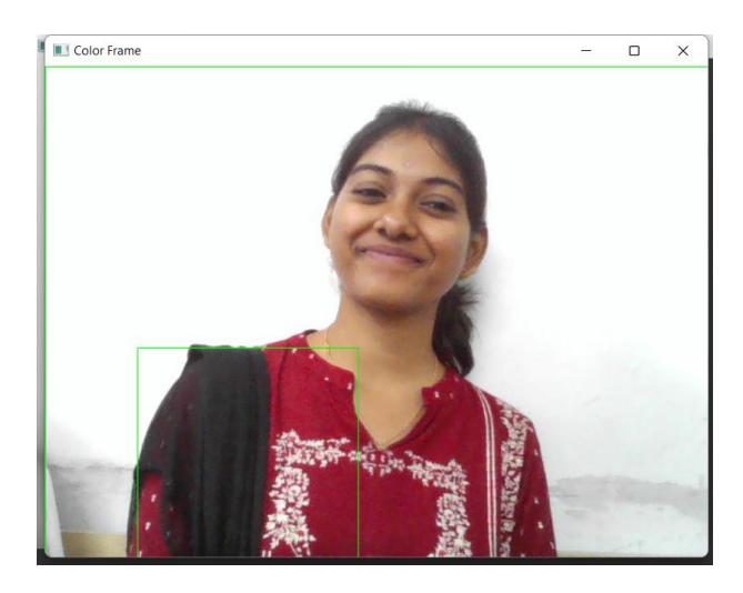
FIG 6.4 COLOR FRAME