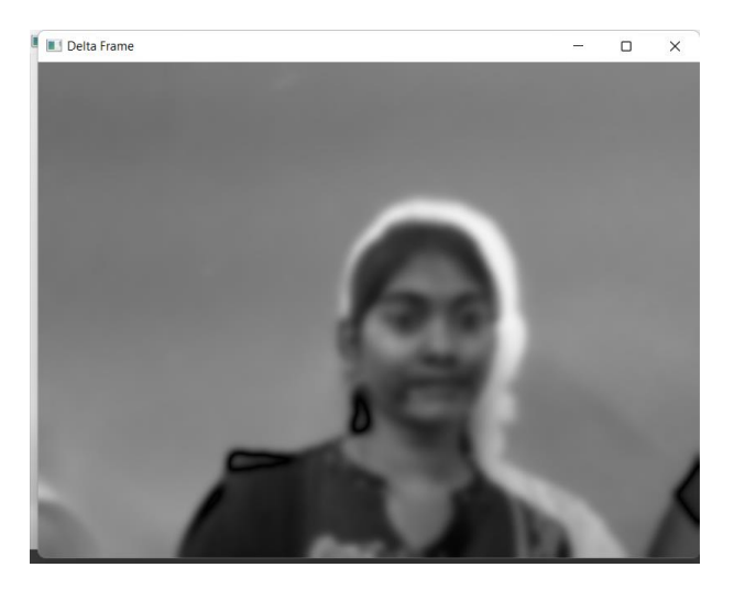
FIG 6.3 THRESHOLD FRAME