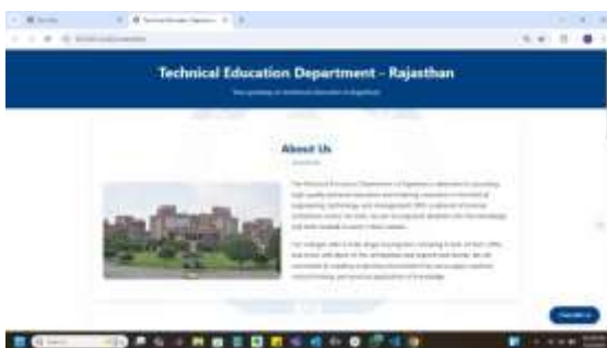
Figure 3.2: User Interface of the College Enquiry Chatbot

The UI of the proposed chatbot system is designed to be user-friendly and responsive . The user interacts with the chatbot by entering queries regarding college admission, courses, deadlines, and other academic-related information. The system uses natural language processing (NLP) techniques powered by RASA , which ensures real-time, accurate responses.