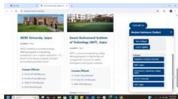
Figure 3.4: Role-Based Access Flow in the System

To ensure the system's security, Role-Based Access Control (RBAC) is implemented. Each user is assigned a role upon login, and the chatbot's responses are tailored based on this role. For example, prospective students will get information regarding admission processes , while current students might receive data on academic schedules .