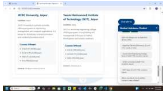
Figure 4.2: Access Control Simulation Based on User Roles

Testing for RBAC functionality showed that the system correctly identified user roles through JWT tokens and restricted access to information accordingly. For instance, admin users were allowed to view analytics and student registration data, while prospective users were limited to general FAQs and admission guidelines [xv, xxiv].