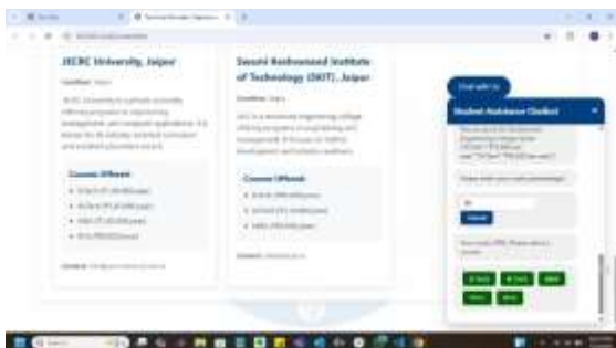
Figure 4.1: Confusion Matrix for Intent Recognition

The chatbot showed a high accuracy rate in intent recognition , with an average confidence score above 90% for frequently asked questions (FAQs). The integration of RASA NLU provided a flexible pipeline for training data, entity recognition, and intent classification, which helped fine-tune the chatbot's responses across various domains of college-related queries [i, ii].