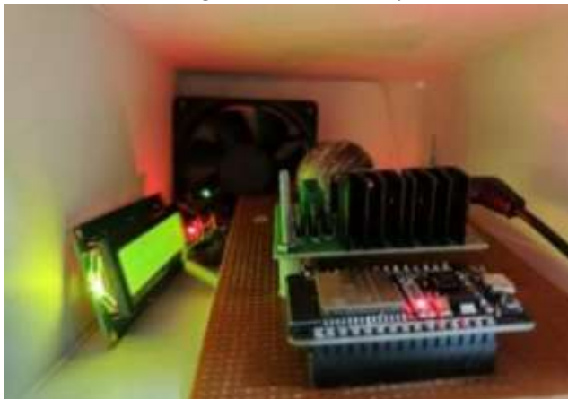
Figure 2.HARDWARE MODEL

The system enhances post-harvest management by minimizing manual inspections and providing automated alerts, reducing food wastage and improving supply chain efficiency. By integrating IoT technology and wireless communication, this innovative solution helps maintain vegetable freshness, promotes sustainable agricultural practices, and contributes to global food security.