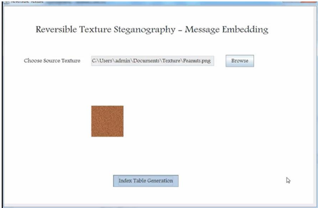
Fig 3 : Message Embedding