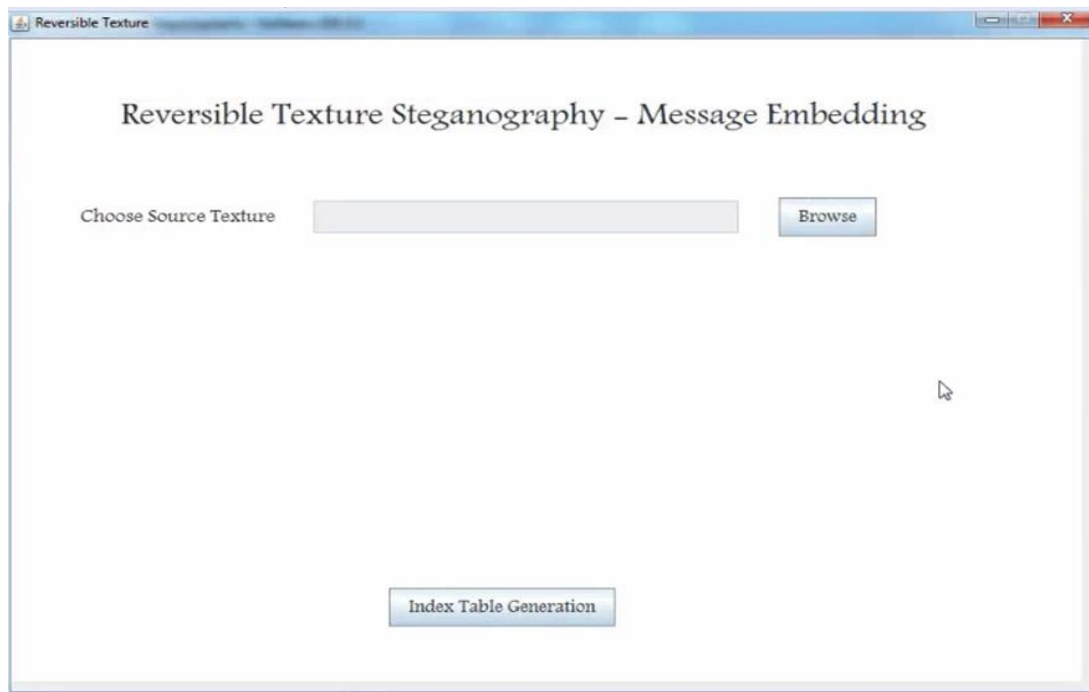
Fig 2 : Reversible Texture Steganography