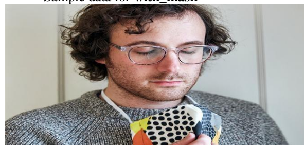
Sample data for without_mask