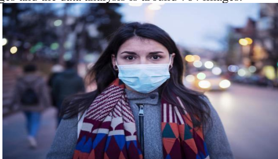
Sample data for with_mask

without_mask has 1916 images. Initially we collected more than 4,400 image snippets where a few were rejected / deleted due to blurring, not deletion. Here we can see the data cutting done. The database is divided into 80% of training data and 20% of test data this is done using the help of sklearn lib. The images used for the training set are approximately 3067 images and the data analysis is around 764 images.