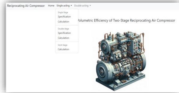
Figure 4.2: Layout of reciprocating air compressors

Figure 4.1. represents the display of an air compressor calculator. The layout has a picture of reciprocating air compressors and two push buttons. The labels in the push buttons are Reciprocating air compressor and volumetric efficiency. By clicking on the Reciprocating air compressor push button, it opens a new page.