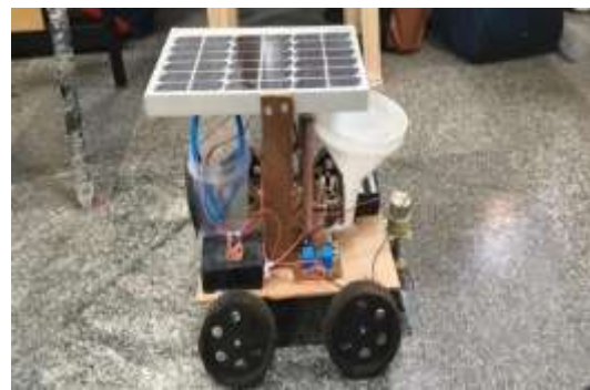
Fig 2 Solar based multifunctional agricultural machine using zigbee

The proposed system was tested under different operating conditions. The solar panel successfully powered the system during daylight conditions. Zigbee communication enabled smooth and reliable wireless control of the machine. The ploughing and grass cutting seed sowing and water sprinkling operations