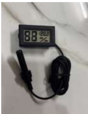
Fig: Temperature Sensor

A temperature sensor measures the internal temperature of the refrigeration chamber. It can be a thermistor, digital sensor (DS18B20), or a thermocouple. The data from the sensor can be used to control the Peltier module, ensuring efficient cooling and preventing overheating or excessive power consumption.