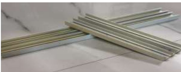
Fig: Heat Sink