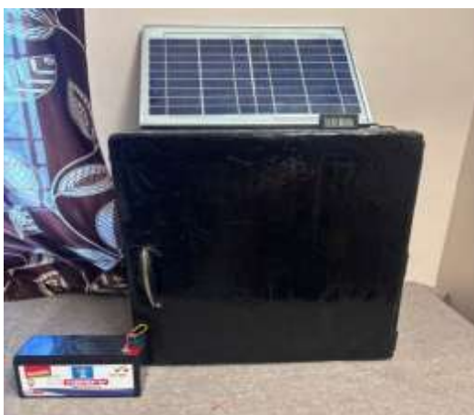
Fig : Output of the Project

The experimental findings demonstrate how the temperature has been steadily dropping over time. Based on the thermoelectric module, the model was created in precisely 22.14 minutes, with a temperature drop of around 18.8°C from 34.5°C. The battery's total power was approximately 12 volts, and the completely charged battery's total ampere was approximately 16.5 amps. It takes three hours in total to reach 0°C with all of the research and other experimental factors. About 40 amps of current are needed overall, with 12 volts of electricity.