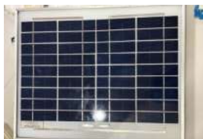
Fig: 12-Volts Solar Panel

A solar panel converts sunlight into electrical energy using photovoltaic cells. In this setup, a 12V solar panel provides DC power to charge the battery and run the cooling system. The efficiency of the solar panel depends on factors like sunlight intensity, panel orientation, and weather conditions.