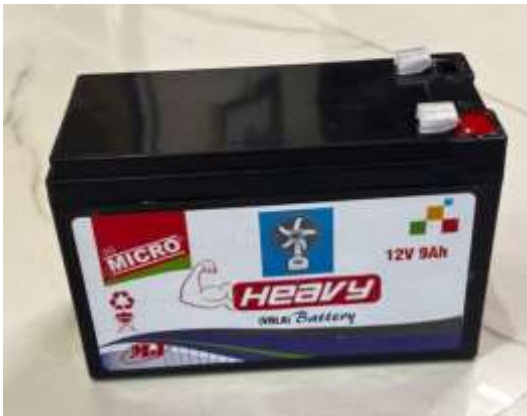
Fig: Battery (12V, 9Ah)

A 12V, 9Ah battery stores electrical energy to power the system when sunlight is unavailable or insufficient. The Amp-hour (Ah) rating indicates how much charge the battery can hold. In this case, a 9Ah battery can theoretically provide 9A for 1 hour or 1A for 9 hours before needing a recharge.