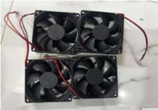
Fig: Cooling Fans (12V)

Cooling fans help in dissipating heat from the hot side of the Peltier plate. Without proper heat dissipation, the Peltier module becomes inefficient, and cooling performance decreases. 12V fans are commonly used in such applications to improve airflow and maintain thermal balance.