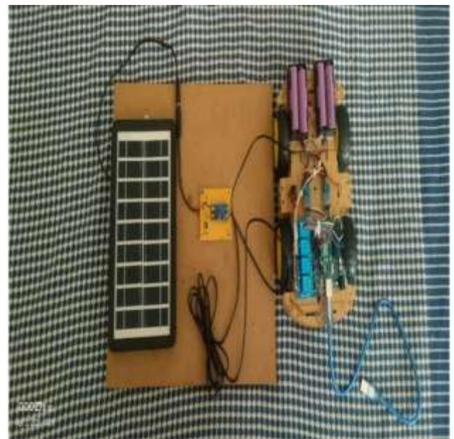
Fig 1 working model of solar ev with dual cell technology

battery system, the project ensures continuous power supply and enhances the reliability of electric mobility. The intelligent switching between primary and secondary batteries helps maintain uninterrupted operation even under low sunlight or during extended usage, making the system practical for real-world conditions. This innovative approach not only reduces dependence on conventional energy sources but also contributes to reducing greenhouse gas emissions and lowering operational costs. The successful implementation of this project demonstrates the potential of combining renewable energy with smart battery management to build eco-friendly transportation solutions. With further improvements in solar technology and energy storage, this concept holds great promise for large-scale adoption and a cleaner, greener future in the field of electric vehicles.