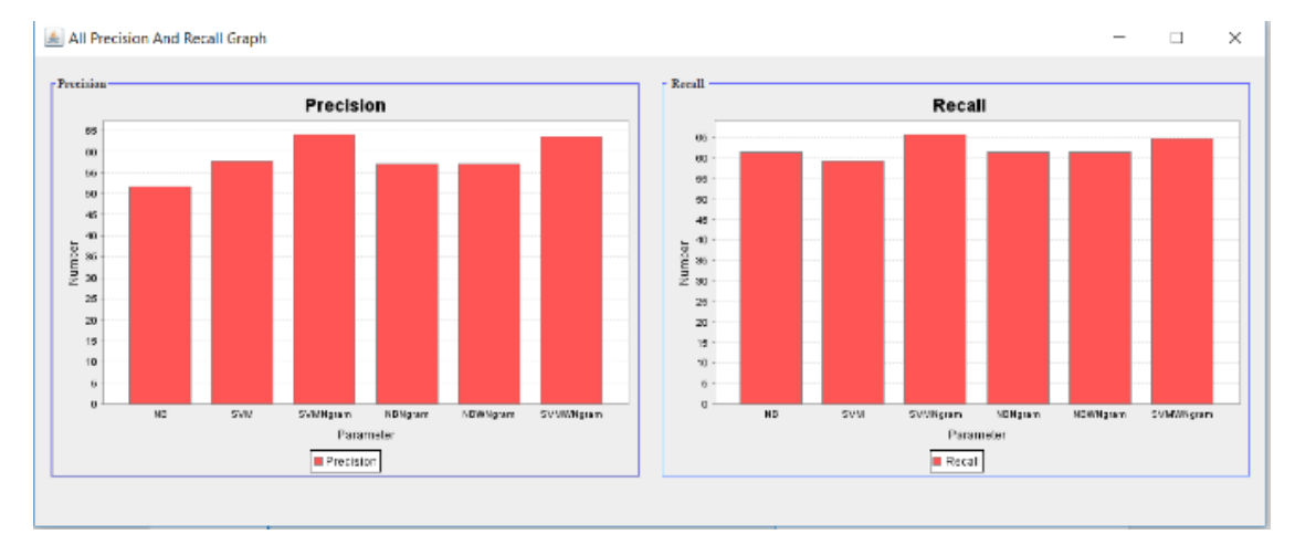
Figure 2: Overall classification for all five Test Cases