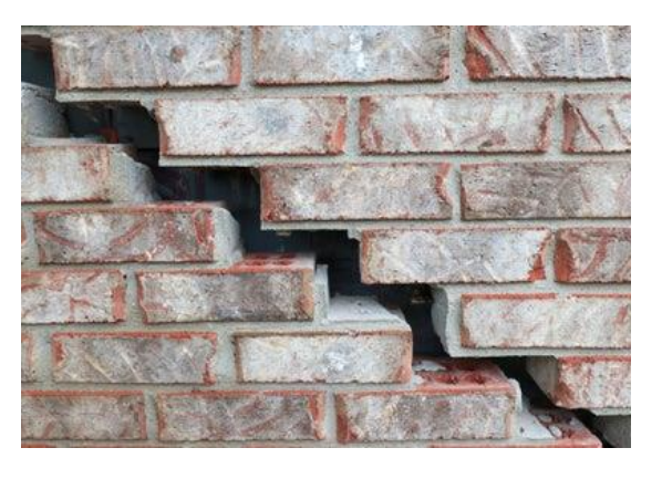
Figure 11. Exterior Crack

earthquake. This type of cracking commonly occurs when one side of the foundation settles while the other remains stable, causing a disparity in weight distribution that pulls the brick walls apart. Such signs are critical indicators that the structural integrity of the foundation may be compromised.