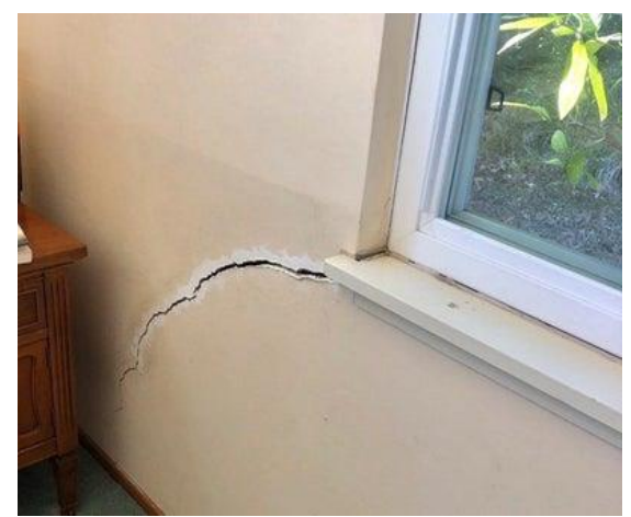
Figure 10. Interior cracks

Interior cracks , especially those starting from door and window frames, are clear warning signs of foundation settlement following an earthquake. Drywall nail pops are also often indicative of shifting structures, which may occur when the foundation moves.