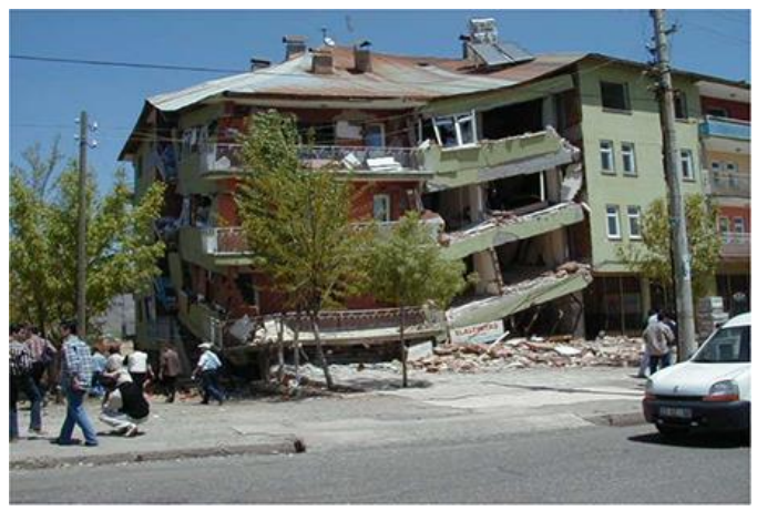
Figure 4. Inadequate Gap between the Building

Buildings are sometimes constructed adjacent because of the lack of building lots. In this layout plan, one or two faces of two buildings are in contact to each other. Consequently, the buildings that have not adequate gaps pound to each other during the earthquake. If the floors of the buildings are not at the same level, pounding effect of the buildings becomes more dangerous. Figure 4 shows this type of damage during the 2003 Bingol earthquakes.