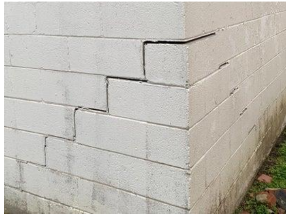
Figure 9. Foundation Shifting

If foundation is leaning or sinking, this could indicate foundation failure, possibly triggered by an earthquake. For homes with basements, check for walls that are leaning or bowing. If the home is built on a slab foundation, keep an eye out for any gaps or spaces between the foundation and the house itself.