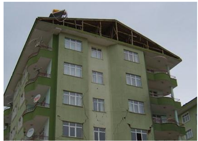
Figure 6. Failures of Gable Walls