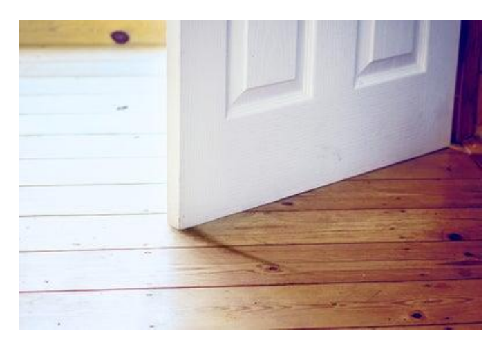
Figure 12. Misaligned Doors and Windows

Misaligned windows and doors often indicate foundation settlement after an earthquake. When one side of a frame sinks more than the other, doors and windows may stick.