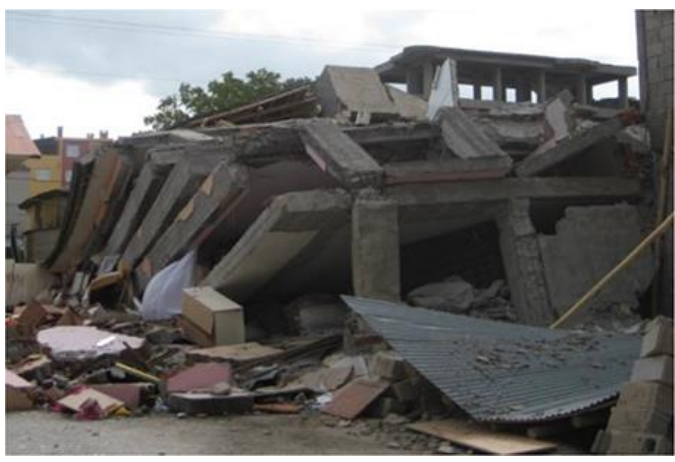
Figure 5. Strong Beam – Weak Column

Deep and rigid beams are used with flexible columns in type of buildings. Therefore, these beams resist more moments, occurred by dynamic loads, than weak columns. In such a design during an earthquake while deep and rigid beams show elastic behavior, shear failure or compression crushing causes plastic hinges at flexible columns. Failure mechanism of strong beam–weak column can be seen in Figure 5.